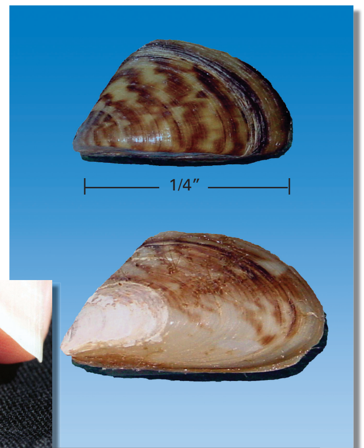
Zebra and Quagga mussels