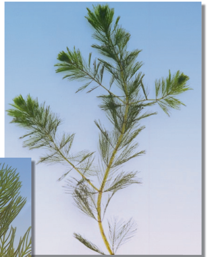
Eurasian Water Milfoil Elizabeth Czarapata

Thanks for doing your part to prevent the spread of invasive aquatic species.