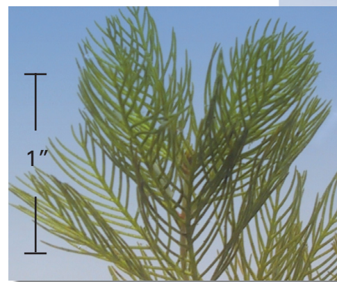
Eurasian Water Milfoil King County Lake Stewardship Program