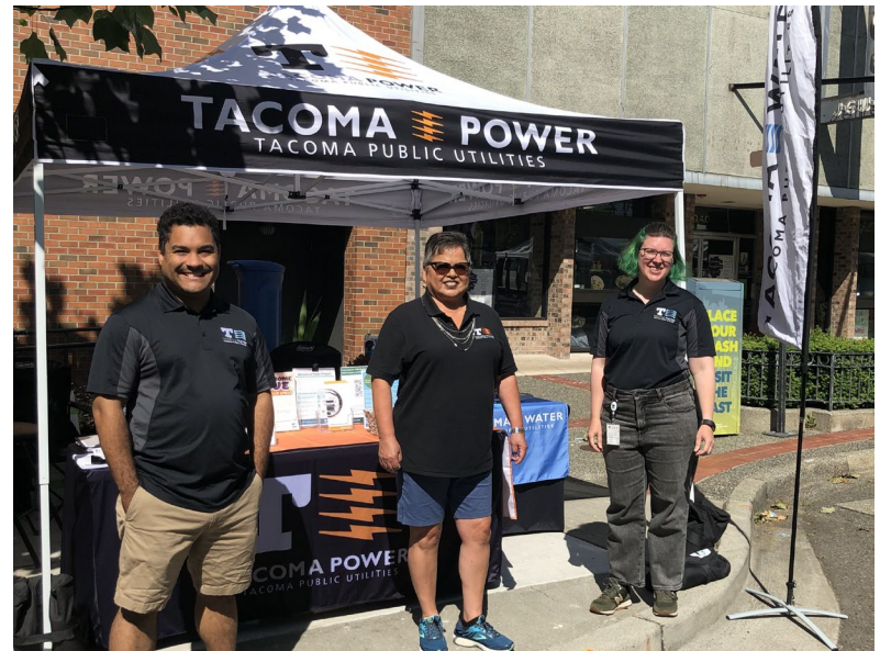
Power/Water community outreach tent