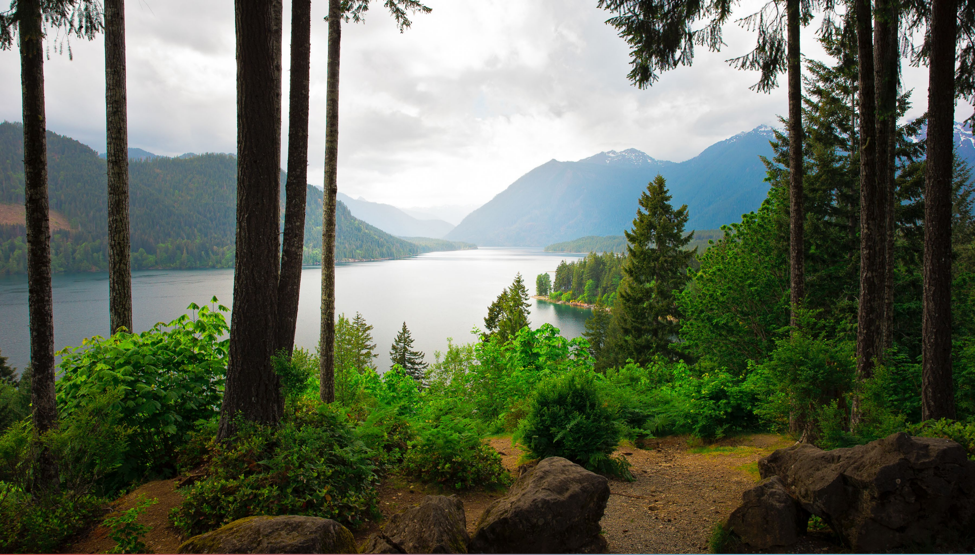
Area near Cushman Dam