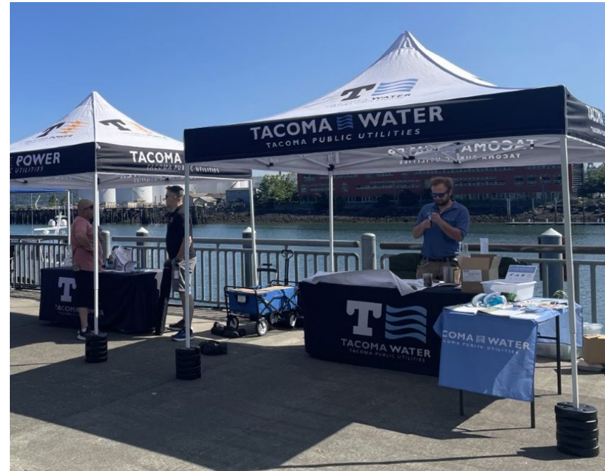
Water and Power at Ocean Fest 2023