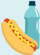
A hot dog and bottle of water.

We'll celebrate your support for seniors during the game as the Tacoma Rainiers present a big check to reveal the amount raised for our Senior Assistance Fund. We look forward to seeing you there! U*